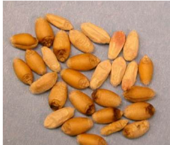
Image 1. Scabby and Tombstone Kernels

If growers absolutely need to plant saved seed due to availability or other economic considerations, the following steps should be taken to increase the likelihood of establishing a legal and good wheat crop: