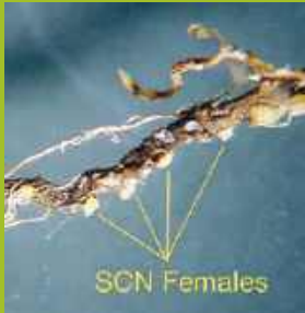
White females of SCN on soybean roots are visible to the naked eye but are still very small (here magnified 32X).