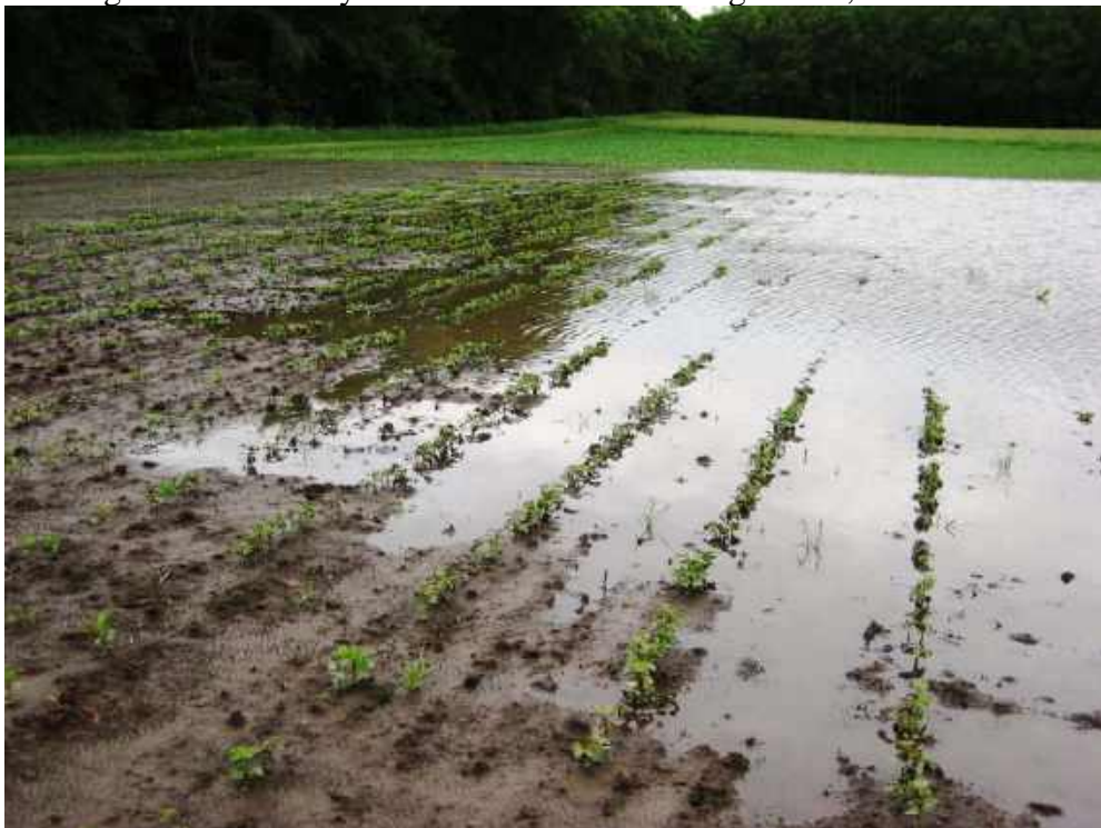
Image 1. Flooded soybean field located at Arlington WI, June 8 th 2008.

Severe flooding has many low-lying soybean fields underwater. As the water dissipates yield potential and replant questions will arise. Flooding can be divided into either water-logging, where only the roots are flooded, or complete submergence where the entire plants are under water (VanToai et al., 2001). Water-logging is more common than complete submergence and is also less damaging. Soybeans can generally survive for 48 to 96 hours when completely submersed (Image 1). The actual time frame depends on air temperature, humidity, cloud cover, soil moisture conditions prior to flooding, and rate of soil drainage. Soybeans will survive longer when flooded under cool and cloudy conditions. Higher temperatures and sunshine will speed up plant respiration which depletes oxygen and increases carbon dioxide levels. If the soil was already saturated prior to flooding, soybean death will occur more quickly as slow soil drainage after flooding will prevent gas exchange between the rhizosphere and the air above the soil surface. Soybeans often do not fully recover from flooding injury.