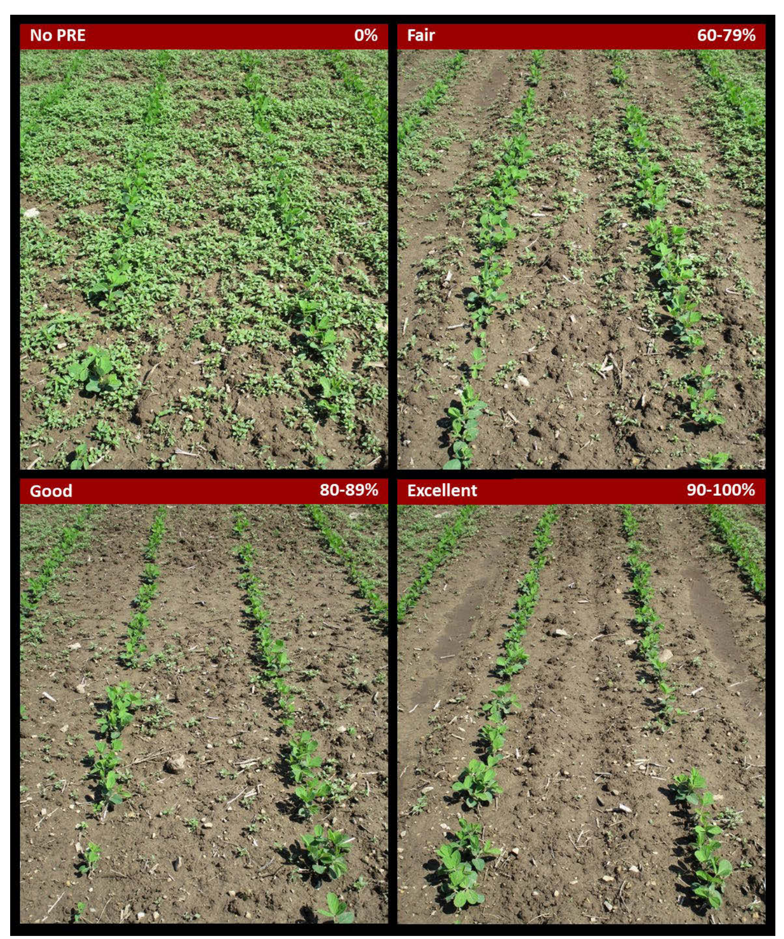
Figure 1 . Plot photos indicating categories of PRE herbicide waterhemp efficacy. Pictures were taken around 25 days after the PRE application from a trial located at the O'Brien Hybrids Farm near Brooklyn, WI